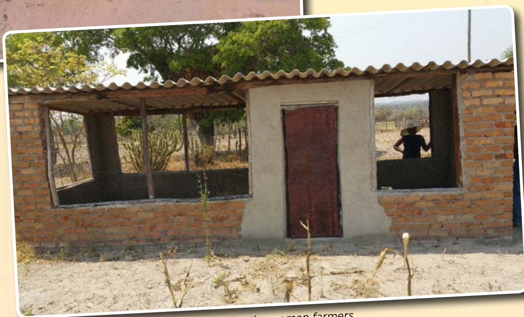
One of the poultry houses constructed by the women farmers.