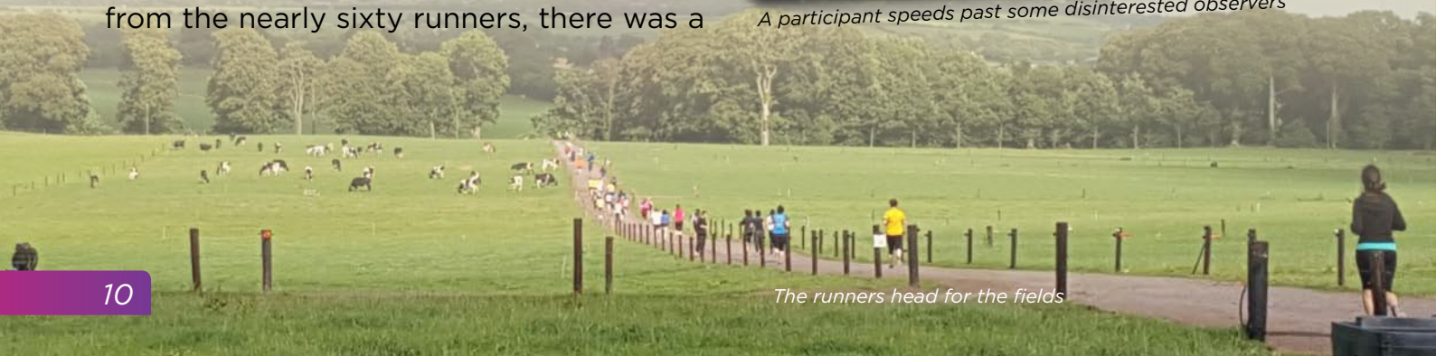
The runners head for the fields