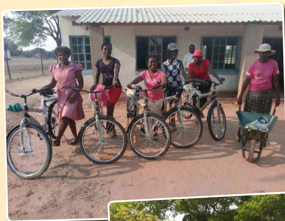
The CFs and CAHW receiving bicycles from the Project.

The recipients received training in poultry husbandry, microfinance, financial literacy and group governance. Recipients then constructed poultry housing using their own funds and received the birds in mid-October. HIZ also facilitated a vaccination programme of all local poultry in the target area to ensure the disease pressure in the area was reduced prior to placement of the improved poultry breeds.