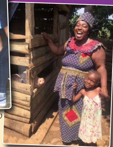
A proud new pig farmer