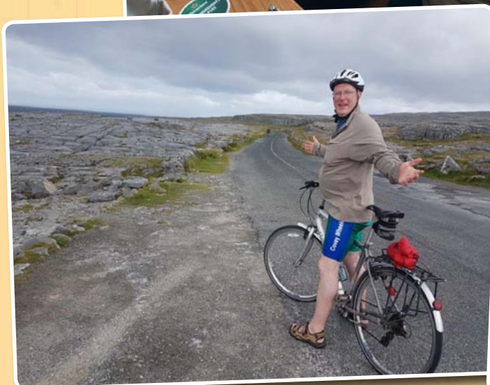
"What a view" (Simon Wall)