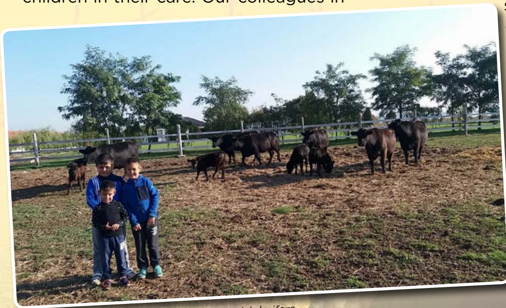
Some of the orphanage kids with the Irish heifers